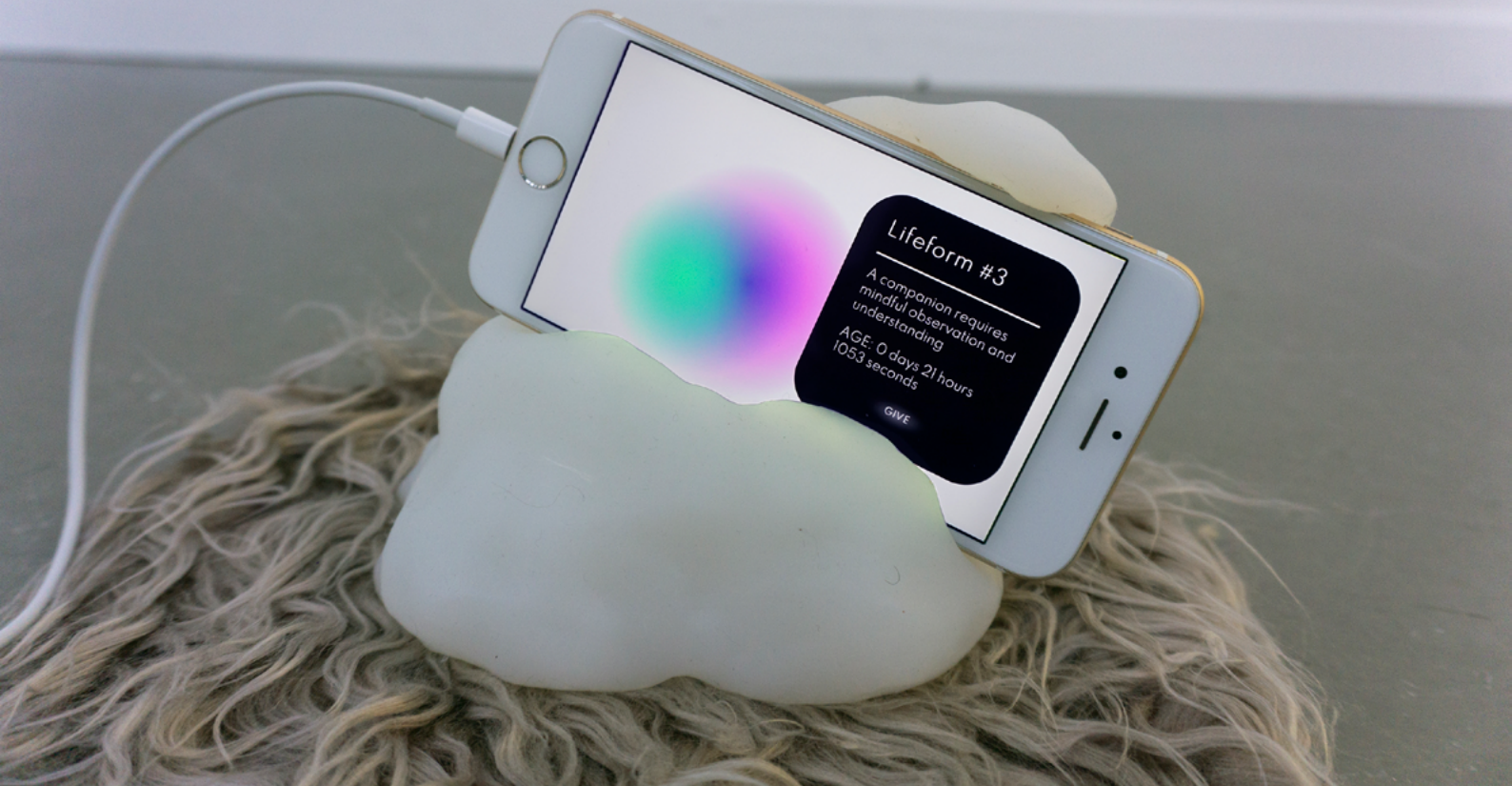
Sarah Friends, LifeForms , 2021

The exhibition marks the conclusion of the project «HEK Connect – cultural participation in the age of a decentralized Internet», funded by the Federal Office of Culture and the departments of Culture Basel-Stadt and Basel-Landschaft, which enables HEK’s innovative positioning as a cultural institution in a globally networked digital economy. This also includes the creation of a blockchain-based circle of friends and events, both online and offline, such as panel discussions, workshops, and collectively initiated projects.